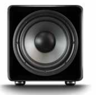
SubSeries 250 | 10" Subwoofer