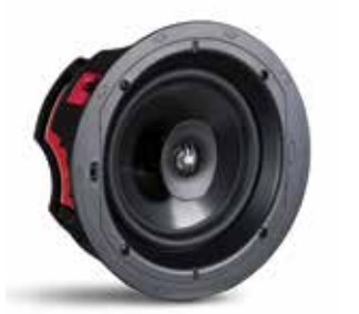
CS810 | 8" In-Ceiling Speaker