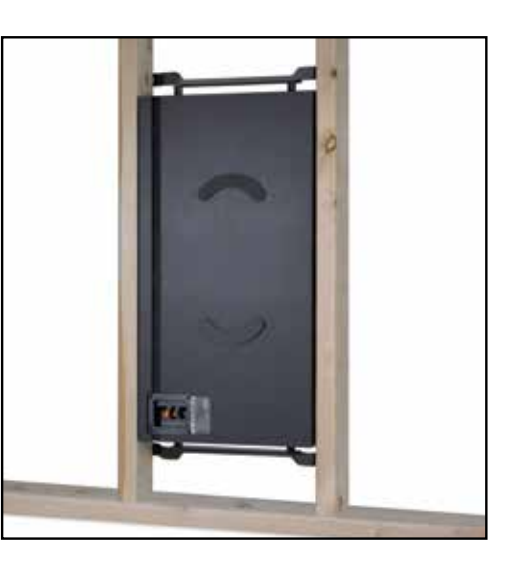
CSIW SUB10 | Installed Back