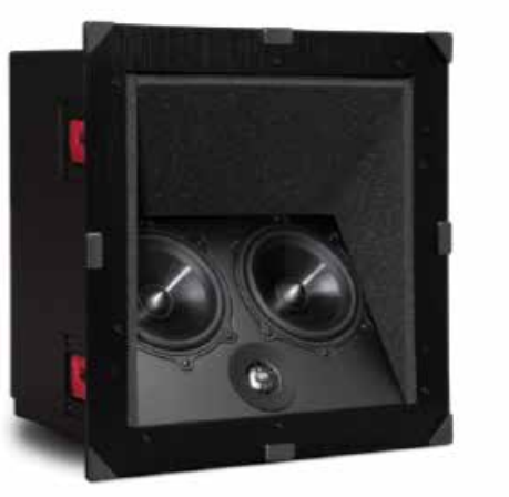
C-LCR | Angled In-Ceiling

W-LCR In-Wall – The W-LCR was developed to cover several system design solutions. Designed with a highly refined driver complement, it is the in-wall centre/surround match for the Synchrony Series. Its incredible tonal characteristics and expansive dispersion make it the ideal choice for any and all channels.