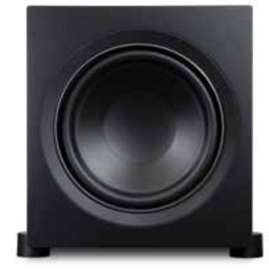
Alpha S10 | 10" Subwoofer

For more detailed product info and specs click here >