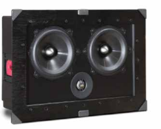
W-LCR | In-Wall Speaker