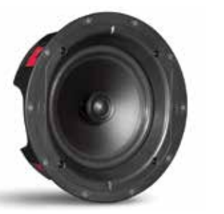
CS805 | 8" In-Ceiling Speaker