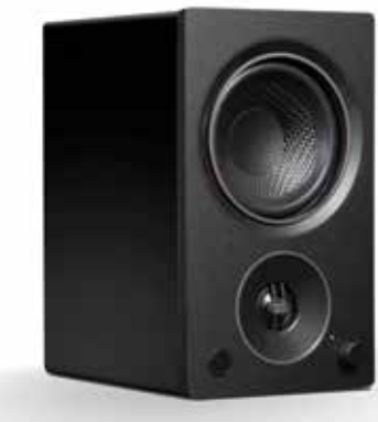
Alpha AM5 | Powered Bookshelf Speakers

For more detailed product info and specs click here >