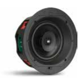
CS610 | 6" In-Ceiling Speaker