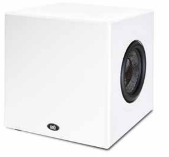
SubSeries BP8 | White