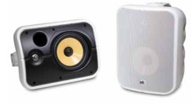
CS 1000 | Universal Speakers