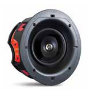
CS AIC 860 | 6" Angled In-Ceiling Speaker