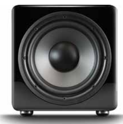
SubSeries 450 | 12" DSP Subwoofer

For more detailed product info and specs click here >