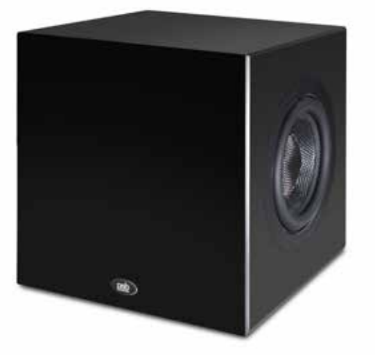
SubSeries BP8 | Black