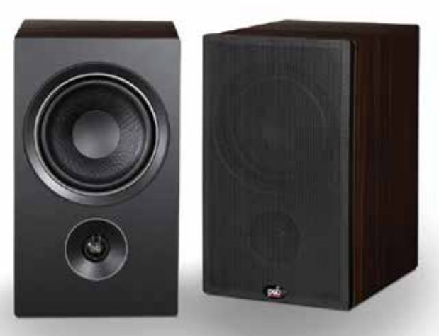
Alpha P5 | Bookshelf Speaker