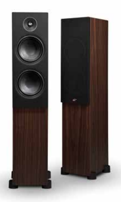
Alpha T20 | Tower Speaker

For more detailed product info and specs click here >