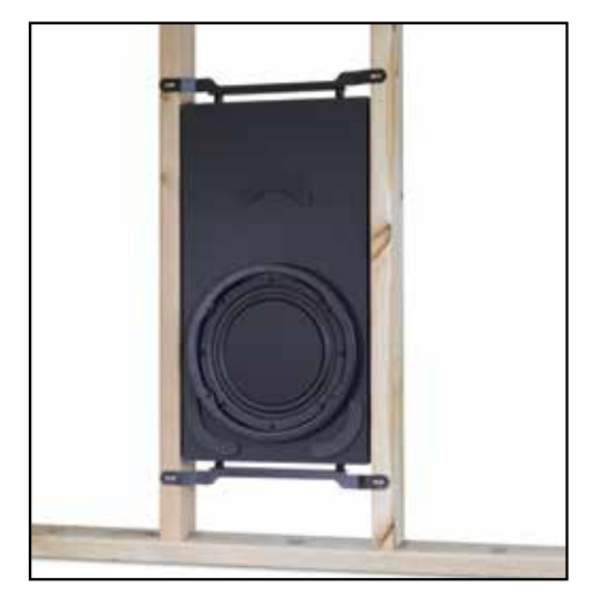
CSIW SUB10 | Installed Front

For more detailed product info and specs click here >