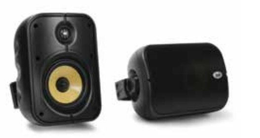
CS 500 | Universal Speakers