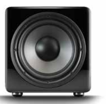
SubSeries 350 | 12" Subwoofer