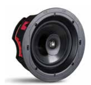
CS850 | 8" In-Ceiling Speaker