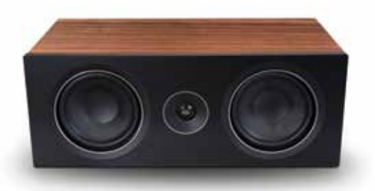
Alpha C10 | Centre Channel