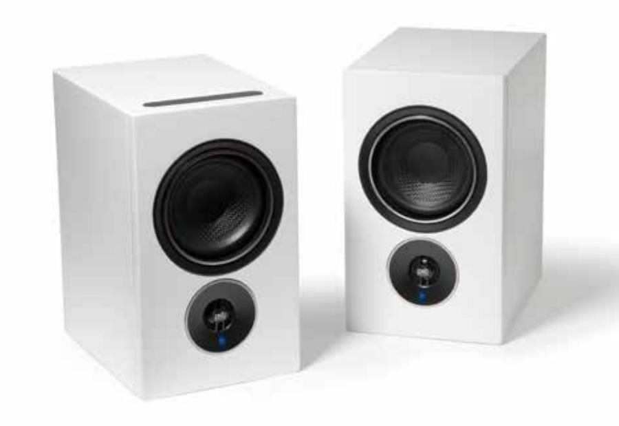
Alpha iQ | BluOS Speakers