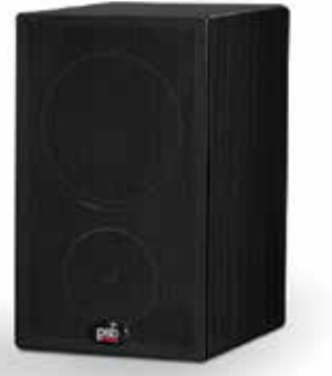
Alpha P3 | Bookshelf Speaker